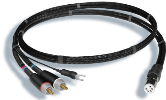
Audience Au24 SE Phono $1390/1m pr.

This new phono cable can be ordered in three different versions, with each version optimized for your cartridge's impedance. A fourth model is made for moving-magnet cartridges. The SE version sports new ultra-low mass RCA connectors with tellurium copper metallurgy. The improvement is dramatic; the Au24 SE is capable of vanishingly low noise and enticing tonal clarity. Any sense of haze is banished by the Au24 SE cable. A vivid sense of air in the treble rounds out the virtues of this outstanding performer. Note that owners of the standard Au24 can upgrade to SE status for $220 per pair. (TAS Issue Number 230)