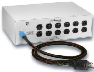
Audience adeptResponse aR12-TSSOX $12,845 (with Au24 SE powerChord)

The aR2p, Audience's compact, dual-outlet power conditioner and isolation device is based on the massive 12-outlet versions of which Audience is rightly proud. Used with a CD player, its enhancement of soundstaging, dimensionality, and depth can be profound. With demanding high-current devices such as amplifiers, transients seemed a little soft. An audition is recommended. Further up the Audience food chain are the 12-outlet heavy-hitters. The aR12 was found to be an extremely effective conditioner, capable of delivering significant improvements in bass definition and depth, overall resolution, and soundstage depth. Its build-quality is nothing short of exemplary. At the top of the hill is the new TSS line with Teflon capacitors. (TAS Issue Numbers 162,179,186,235)