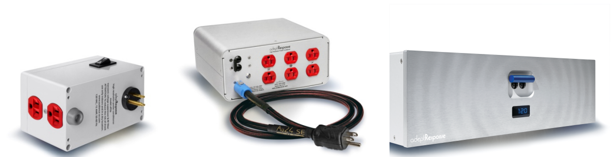
Audience aR-2p/aR12/aR12-TS/aR6-TSS $695/$4995/$8995/$6000

“Don’t let the 1+1 V2+’s nearly identical appearance to the 1+1 fool you; this newly upgraded version is a huge leap over its already superlative predecessor. The V2+ employs a significantly redesigned version of Audience’s full-range driver, top-level Au24SX internal wiring, returned passive radiators, and custom tellurium solderless binding posts. The result is far more resolution and detail (particularly in the treble), superior transparency, wider dynamic expression, and even greater midrange purity. The 1+1 V2+’s midrange clarity, just one of the virtues of a crossover-less single-driver speaker, is on par with that of many speakers costing twenty times the V2+’s price. The state of the art for desktop listening, and a terrific choice as a main speaker in smaller rooms. Robert Harley, review forthcoming.”