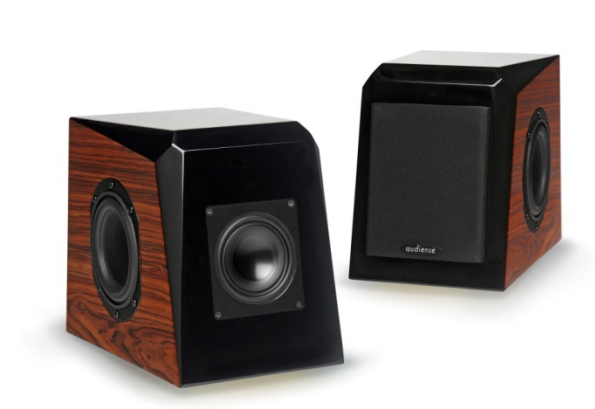
Audience 1+1 V2+ $2345