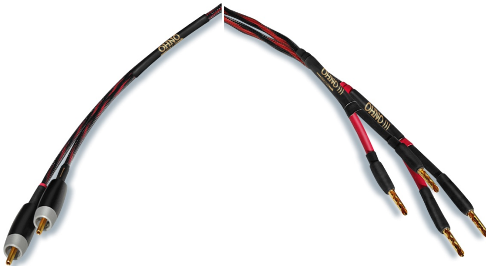
Audience OHNO $199/1m (+82/m) interconnect; $209/1m (+20/m) speaker

The Audience phono cable, in a crowded field of contenders, soars above many of them with its alacrity and transparency. Extremely flexible and lightweight, the phono cable is simplicity itself to use. Coupled with its jackrabbit speed is a naturalness of timber that makes for refined and seductive listening. It also seems to filter out external noise effectively. JHb, 230