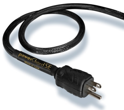
Audience powerChord SE $915/6'

This new USB cable is simply sensational in every way. The Au24 SE USB's clarity, dimensionality, and gorgeous timbre put it in a class by itself. It seems to have no signature of its own, but rather more transparently conveys what's coming from your computer. The dual-cable design separates the signal-carrying and power-carrying conductors. RH, 254