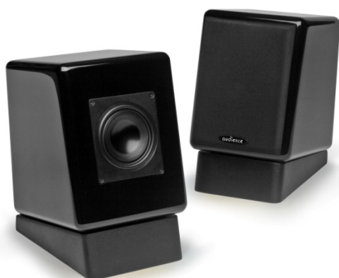
Audience The ONE $995