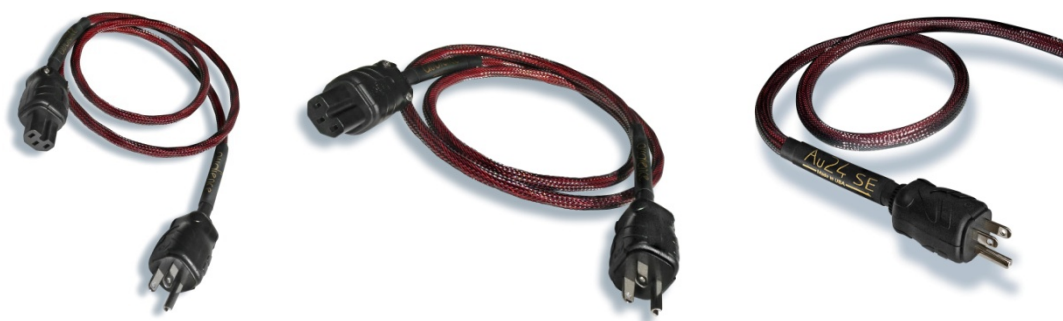
Audience Au24 SE powerChord $1080-$2420/6' depending on power requirement

The Audience powerChords offer bass clarity, weight, and pitch resolution that place them at or near the top of the affordable-power-cord pack. Except for a slight treble congestion and somewhat laid-back overall presentation, there is little deviation from tonal neutrality, NG, 208