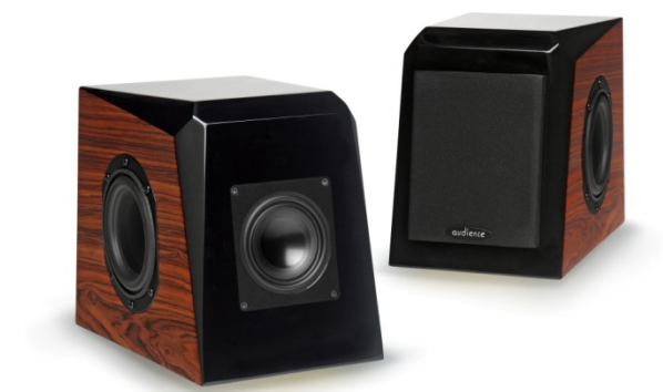
Audience 1+1 V2+ $2345

The ONE, as you might infer from its name, is a single full-range driver shoehorned into a small box. The driver itself is the same unit, the A3S, that Audience uses in its flagship $72,000 16+16 speaker. According to Audience, the A3S has exceptionally flat response, claimed to be +/-3db from 40Hz to 22kHz. Be that as it may, properly set up The ONE is the best desktop speaker reviewer Steven Stone has heard (after the Audience 1+1). SS, 236