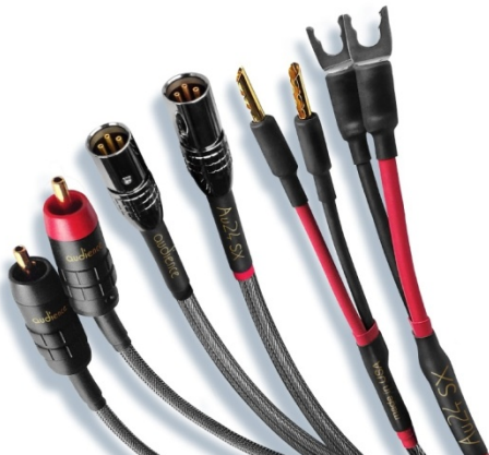
Audience Au24 SX Speaker, $3290/2.5m; interconnect RCA, $1800/1m ($2375/2m)

Audience's new value line of OHNO cables runs counter to the idea that great wire always requires heavy jacketing and complex conductor geometries. Sonically these featherweights were quick and extended with well-focused imaging and dimensionality. Most significantly they were not additive, nor did they crimp dynamics. They were also easy to position for desktop use, offering an unerring sense to musicality without busting the budget. NG, review forthcoming