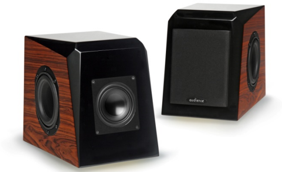
Audience 1+1 V2+ $2345

“Don’t let the 1+1 V2+’s nearly identical appearance to the 1+1 fool you; this newly upgraded version is a huge leap over its already superlative predecessor. The V2+ employs a significantly redesigned version of Audience’s full-range driver, top-level Au24SX internal wiring, returned passive radiators, and custom tellurium solderless binding posts. The result is far more resolution and detail (particularly in the treble), superior transparency, wider dynamic expression, and even greater midrange purity. The 1+1 V2+’s midrange clarity, just one of the virtues of a crossover-less single-driver speaker, is on par with that of many speakers costing twenty times the V2+’s price. The state of the art for desktop listening, and a terrific choice as a main speaker in smaller rooms. Robert Harley, review forthcoming.”