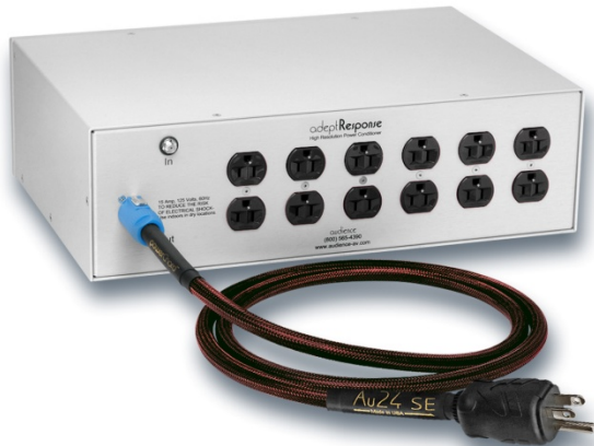
Audience adeptResponse aR12-TSSOX $12,845 (with Au24 SE powerChord)

To Greg Weaver's ear, Audience's new aR12-TSSOX power conditioner represents a substantial improvement over its predecessors, so much so that it would be fair to say that it borders on an order of magnitude advance. This is a world-class device, deserving your full attention. Give one a listen- perhaps the 6- or 2-socket variety- but be prepared to buy it. If you are anything like GW, there is no chance it will come out of your system once it is in place! GW, 268