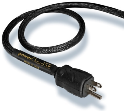
Audience powerChord SE $915/6'

This new USB cable is simply sensational in every way. The Au24 SE USB's clarity, dimensionality, and gorgeous timbre put it in a class by itself. It seems to have no signature of its own, but rather more transparently conveys what's coming from your computer. The dual-cable design separates the signal-carrying and power-carrying conductors. RH, 254