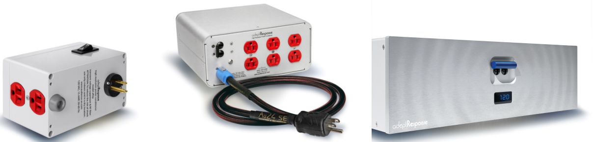
Audience aR-2p/aR12/aR12-TS/aR6-TSS $695/$4995/$8995/$6000

The ONE, as you might infer from its name, is a single full-range driver shoehorned into a small box. The driver itself is the same unit, the A3S, that Audience uses in its flagship $72,000 16+16 speaker. According to Audience, the A3S has exceptionally flat response, claimed to be +/-3db from 40Hz to 22kHz. Be that as it may, properly set up The ONE is the best desktop speaker reviewer Steven Stone has heard (after the Audience 1+1). SS, 236