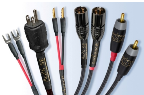
Audience Au24 SE

Interconnect $1290/1m pr.; $1895/1m pr. balanced