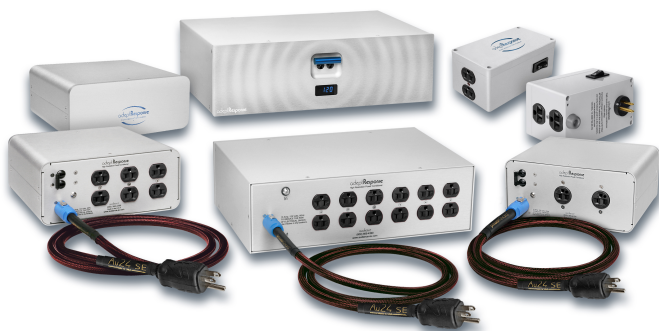
Audience aR2p/aR12/aR12-TS/aR6-TSS $695/$4995/$8995/$6000

To Greg Weaver's ear, Audience's new aR12-TSSOX power conditioner represents a substantial improvement over its predecessors, so much so that it would be fair to say that it borders on an order of magnitude advance. This is a world-class device, deserving your full attention. Give one a listen—perhaps the 6- or 12-socket variety—but be prepared to buy it. If you are anything like GW, there is no chance it will come out of your system once it is in place! (TAS Issue Number 266)