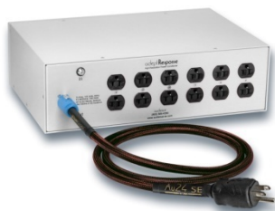
Audience adeptResponse aR12-TSSOX $12,845 (with Au24 SE powerChord)

To Greg Weaver's ear, Audience's new aR12-TSSOX power conditioner represents a substantial improvement over its predecessors, so much so that it would be fair to say that it borders on an order of magnitude advance. This is a world-class device, deserving your full attention. Give one a listen—perhaps the 6- or 12-socket variety—but be prepared to buy it. If you are anything like GW, there is no chance it will come out of your system once it is in place! (TAS Issue Number 266)