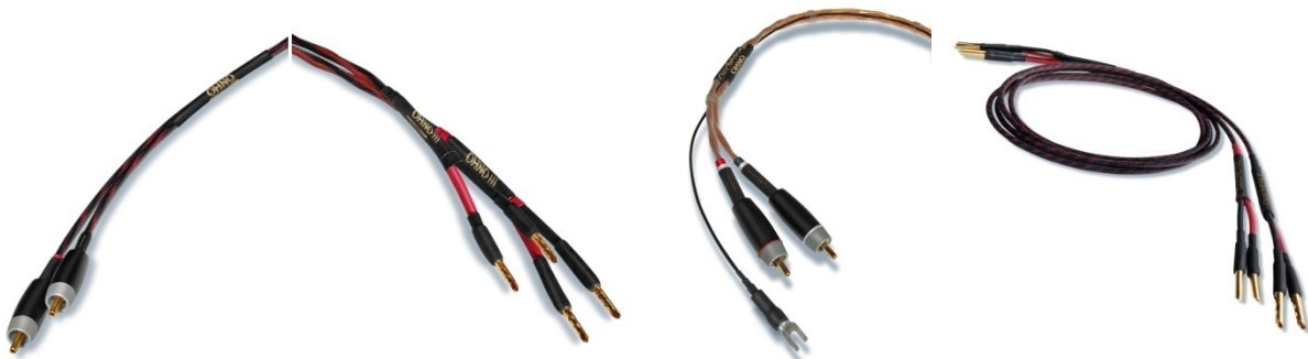
Audience Ohno Interconnect $199/1m (+$82 per meter); speaker $209/1m (+20 per meter)

To Greg Weaver's ear, Audience's new aR12-TSSOX power conditioner represents a substantial improvement over its predecessors, so much so that it would be fair to say that it borders on an order of magnitude advance. This is a world-class device, deserving your full attention. Give one a listen— perhaps the 6- or 12-socket variety –but be prepared to buy it. If you are anything like GW, there is no chance it will come out of your system once it is in place! (TAS Issue Number 266)