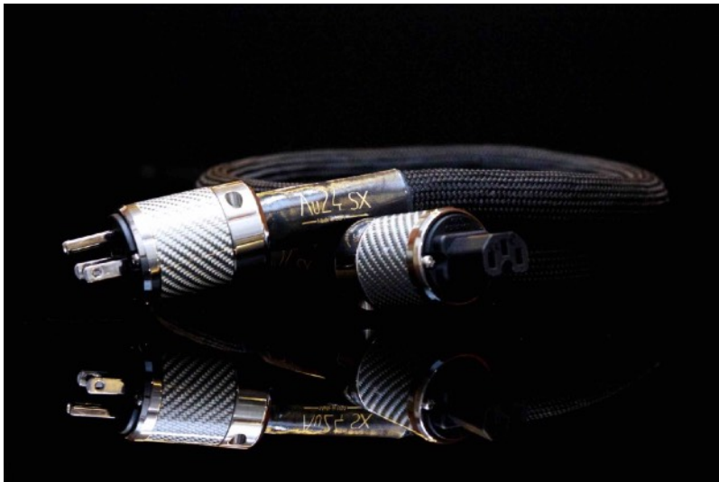
Audience Au24 SX powerChord

The Audience powerChords offer bass clarity, weight, and pitch resolution that place them at or near the top of the affordable-power-cord pack. Except for a slight treble congestion and somewhat laid-back overall presentation, there is little deviation from tonal neutrality. NG, 208