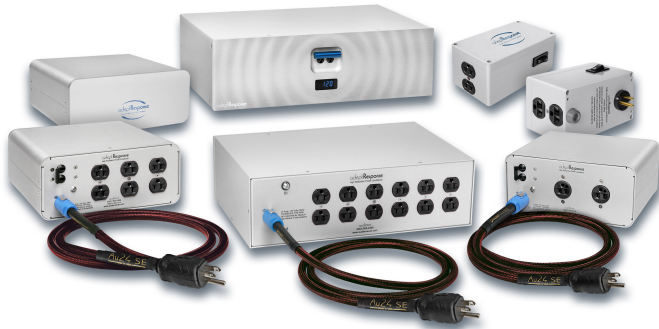
Audience aR2p/aR12/aR12-TS/aR6-TSS $695/$4995/$8995/$6000

The aR2p, Audience's compact, dual-outlet power conditioner and isolation device is based on the massive 12-outlet versions of which Audience is rightly proud. Used with a CD player, its enhancement of soundstaging, dimensionality, and depth can be profound. With demanding high-current devices such as amplifiers, transients seemed a little soft. An audition is recommended. Further up the Audience food chain are the 12-outlet heavy-hitters. The aR12 was found to be an extremely effective conditioner, capable of delivering significant improvements in bass definition and depth, overall resolution, and soundstage depth. Its build-quality is nothing short of exemplary. At the top of the hill is the new TSS line with Teflon capacitors. (TAS Issue Numbers 162,179,186,235)